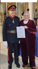
MCC Christmas Lunch