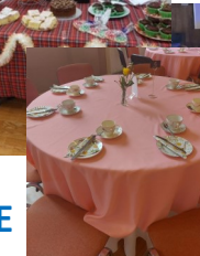
Carol Singing Afternoon tea