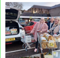
Knitted bells Toy Service 500 Shoeboxes Food bank donations

What a fantastic year 2023 was for St. Chad's Church. Apart from work starting on the church, we had lots of amazing events. Here's just a small assortment of pictures from the year.